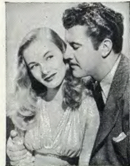
Still 1932-135 Mat 1PF-15 HIGH-TENSION ROMANCE and spine-chilling action are keynotes of the new Paramount adventure thriller, "This Gun for Hire," starring Veronica Lake and Robert Preston (above), which comes ..... at the ..... Theatre. Laird Cregar and Alan Ladd are featured in the exciting film.

Veronica stubbornly refused to let them do any snipping, even if it cost her her chances for a screen career.