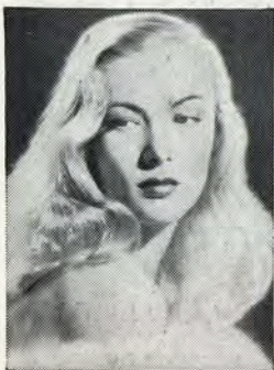
Still P2745-122 Mat 1PE-15 SPY DESTROYER — Veronica Lake, glamorous "blonde bomber" of the screen, leads a spine-chilling life as a night club singer who is also an anti-spy agent, in "This Gun for Hire," new Paramount adventure thriller due at the Theatre, co-starring Robert Preston and featuring Alan Ladd and Laird Cregar.