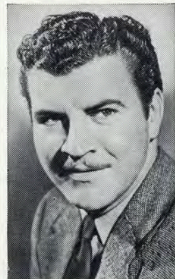
Still P2491-279 Mat 1PB-15

But the up-and-coming film discovery won't be seen as he really is. His naturally blonde hair is dyed black to make him consistent with the character he portrays — a young, ruthless, psychopathic killer!