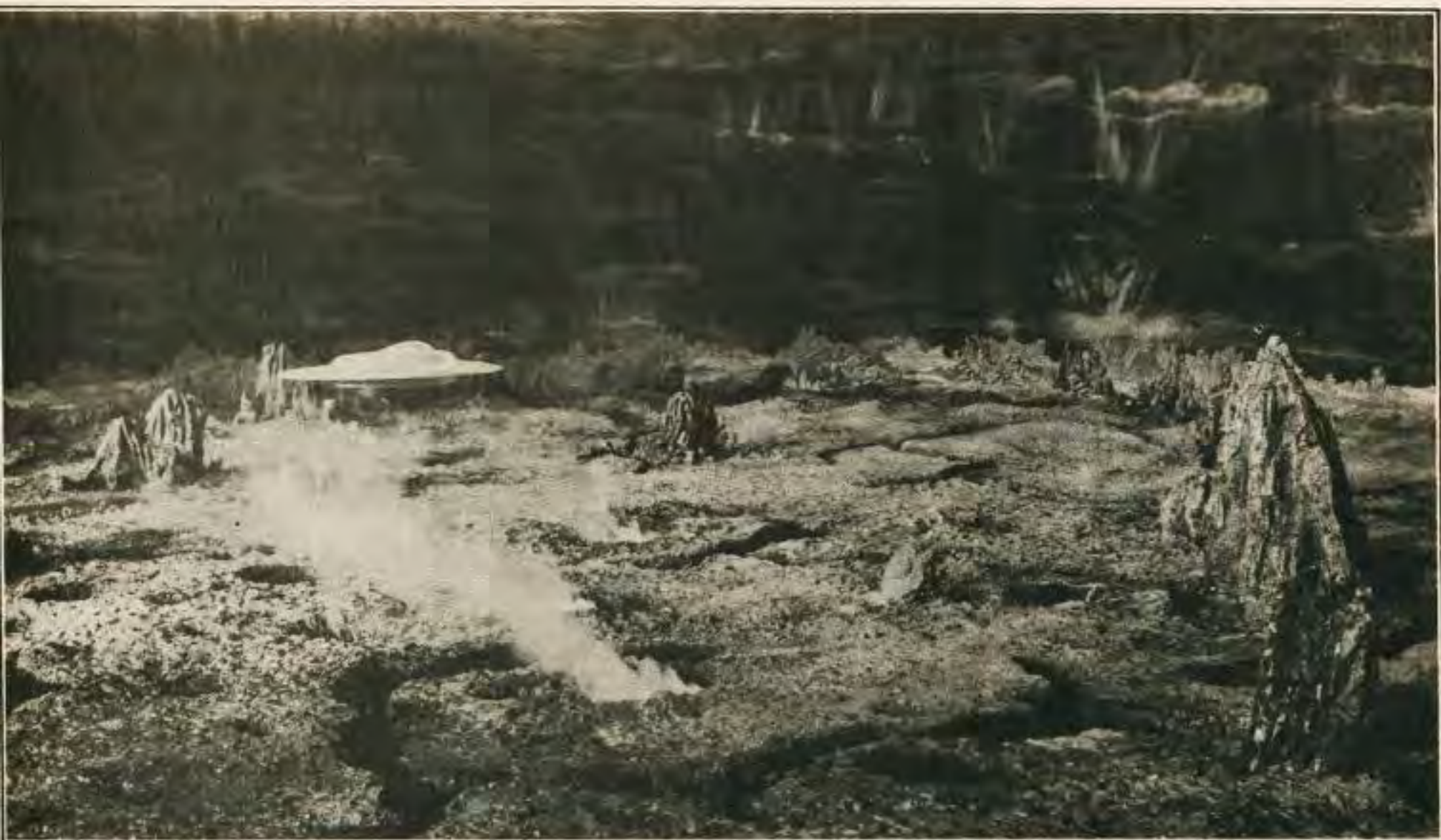
9 The space ship and the abducted scientists fly over Metaluna's wartorn landscape.