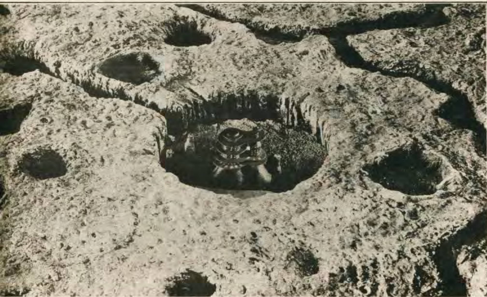
10 The Metalunan cities have gone underground since the war began.