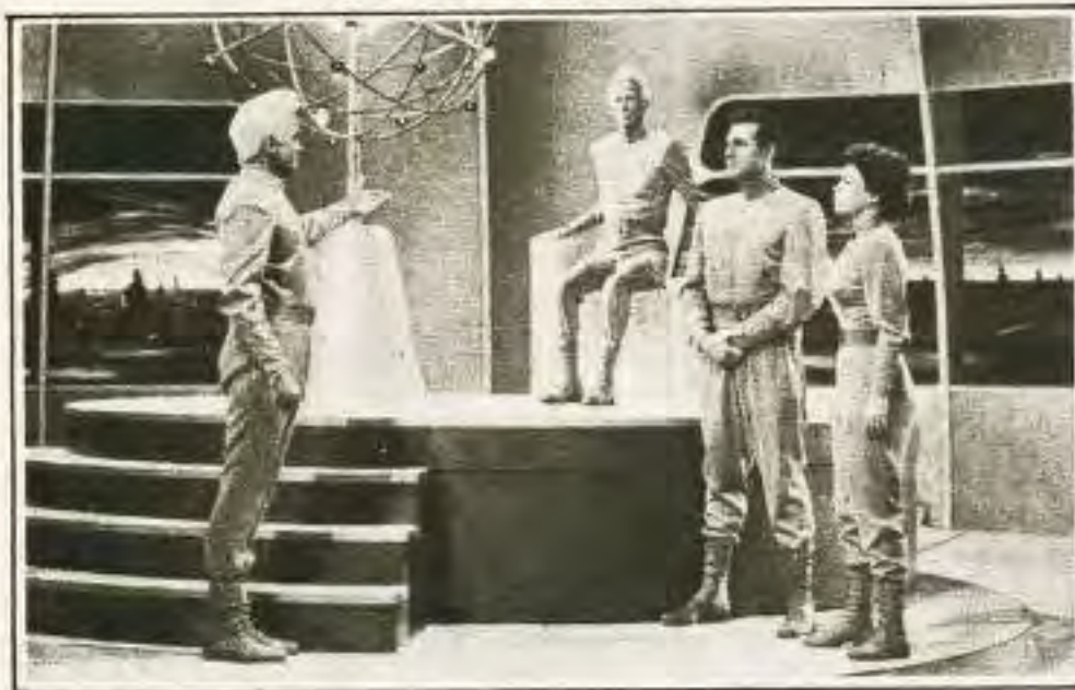
13 The Metalunan people have created a race of my mutants to do their work.