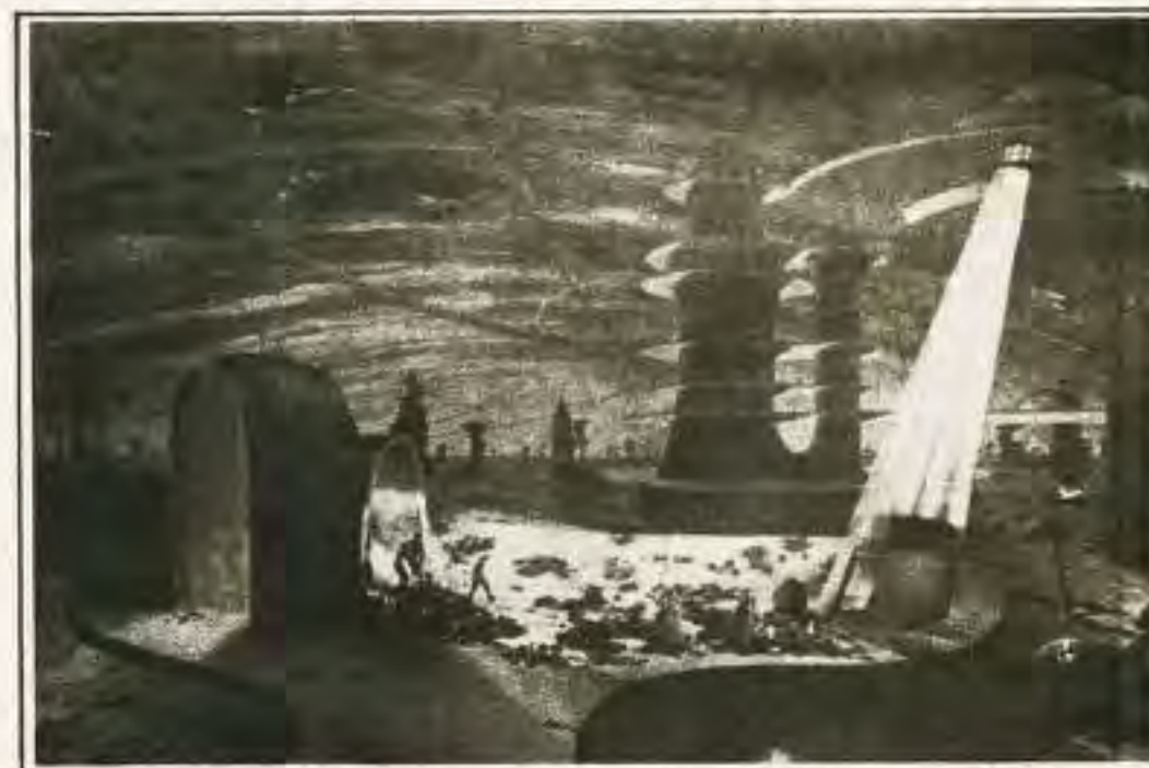
16 The three break out of the center and head for the space ship.