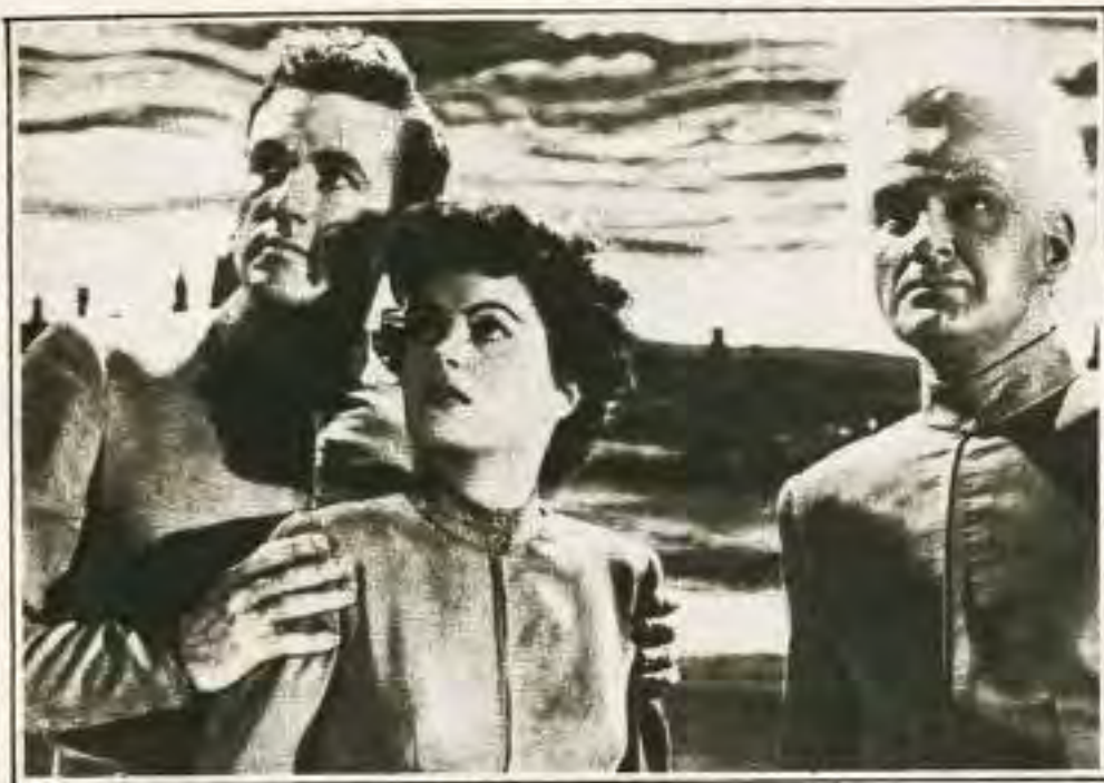
11 Cal, Ruth and Exeter observe the horrors of a planet torn by space wars.